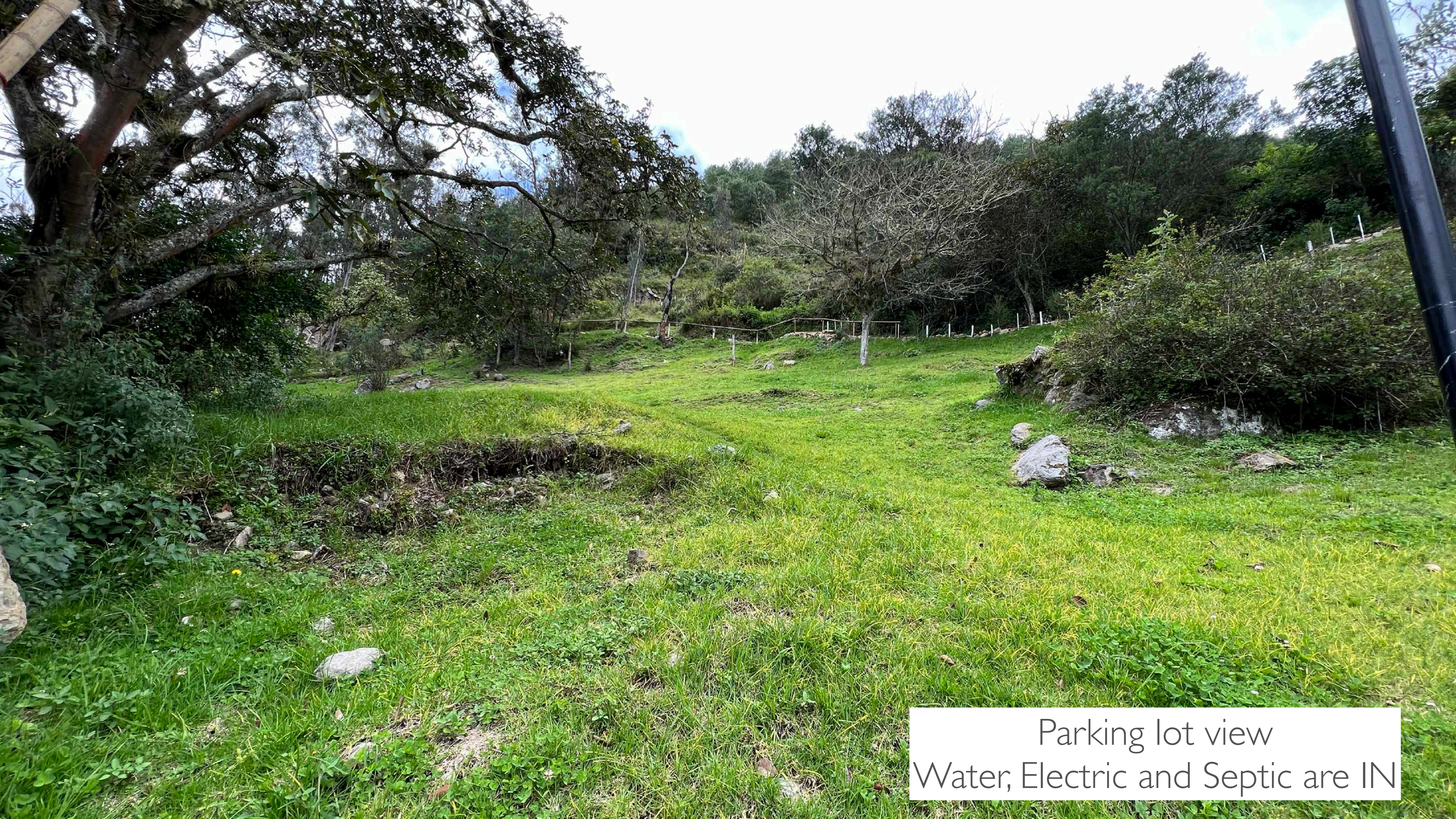
Parking lot view Water, Electric and Septic are IN