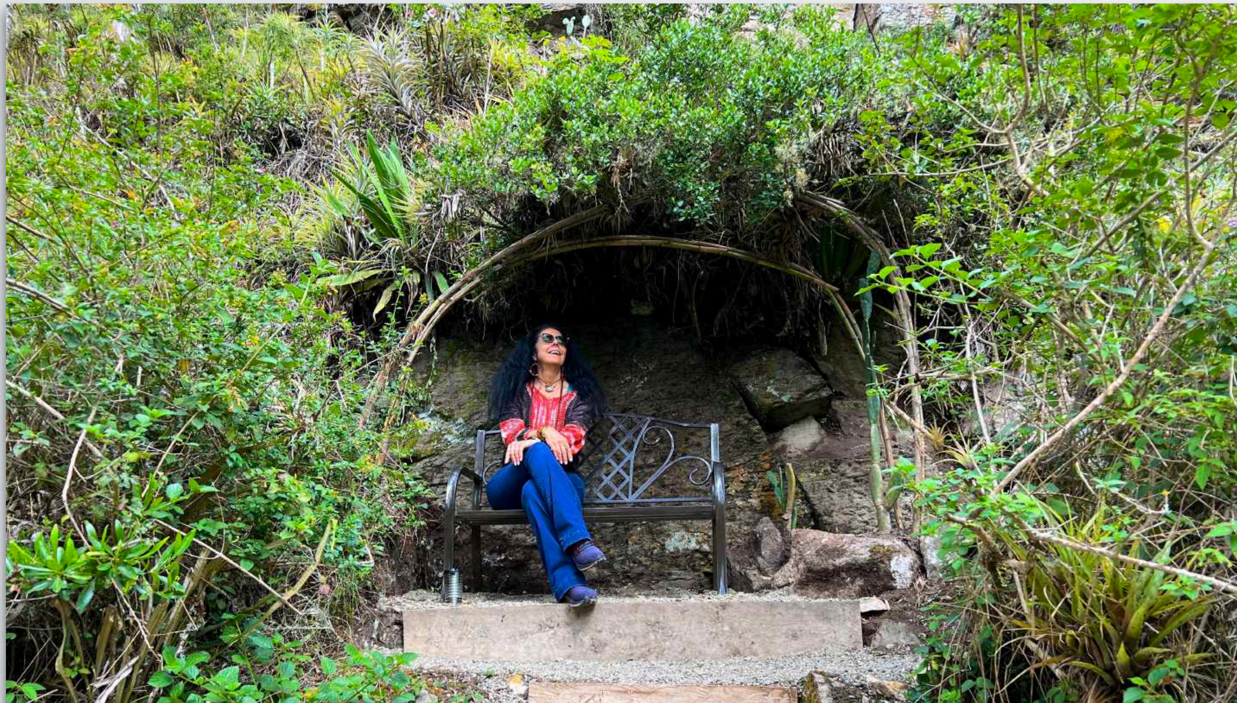
The Owl's grotto

One of the many stunning nature sites literally in your backyard. Walk out your door and on to the trail... breathe Eucalyptus Infused Air 24/7 while hearing the Amazon Tributary of continual renewal.